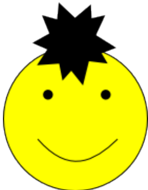
Fig. 2. A bitmap graphic loaded from a PNG file